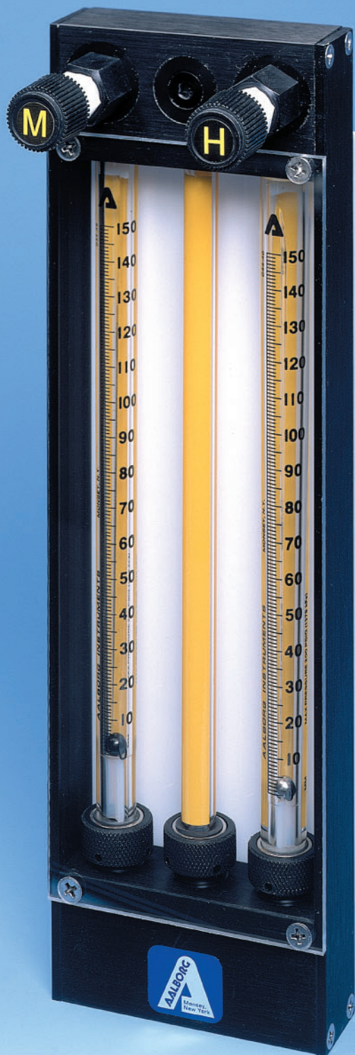
Gas Proportioner with CV™ valve for blending two gases

To blend two or three gases in homogeneous infinitely variable concentrations, directly at the end use point, this Model G gas proportioner is unsurpassed in convenience and economy.