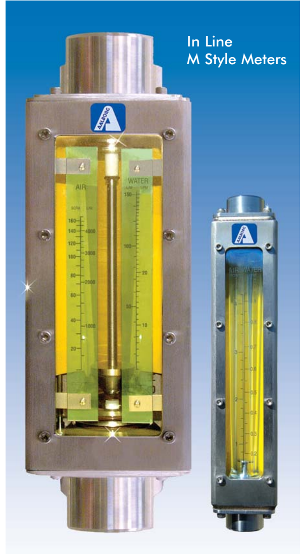
In Line M Style Meters