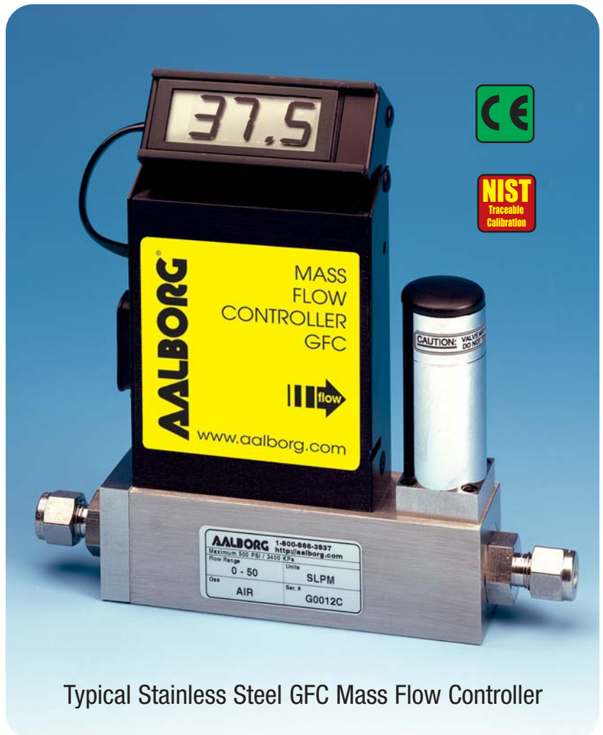
Typical Stainless Steel GFC Mass Flow Controller

Compact, self-contained GFC mass flow controllers are designed to indicate and control flow rates of gases. The rugged design coupled with instrumentation grade accuracy provides versatile and economical means of flow control. Aluminum or stainless steel models with readout options of either engineering units (standard) or 0 to 100 percent displays are available.